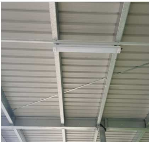
Warehouse | Australia