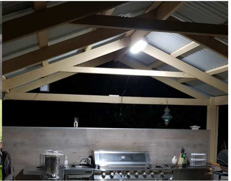
Wood Shelter Lighting